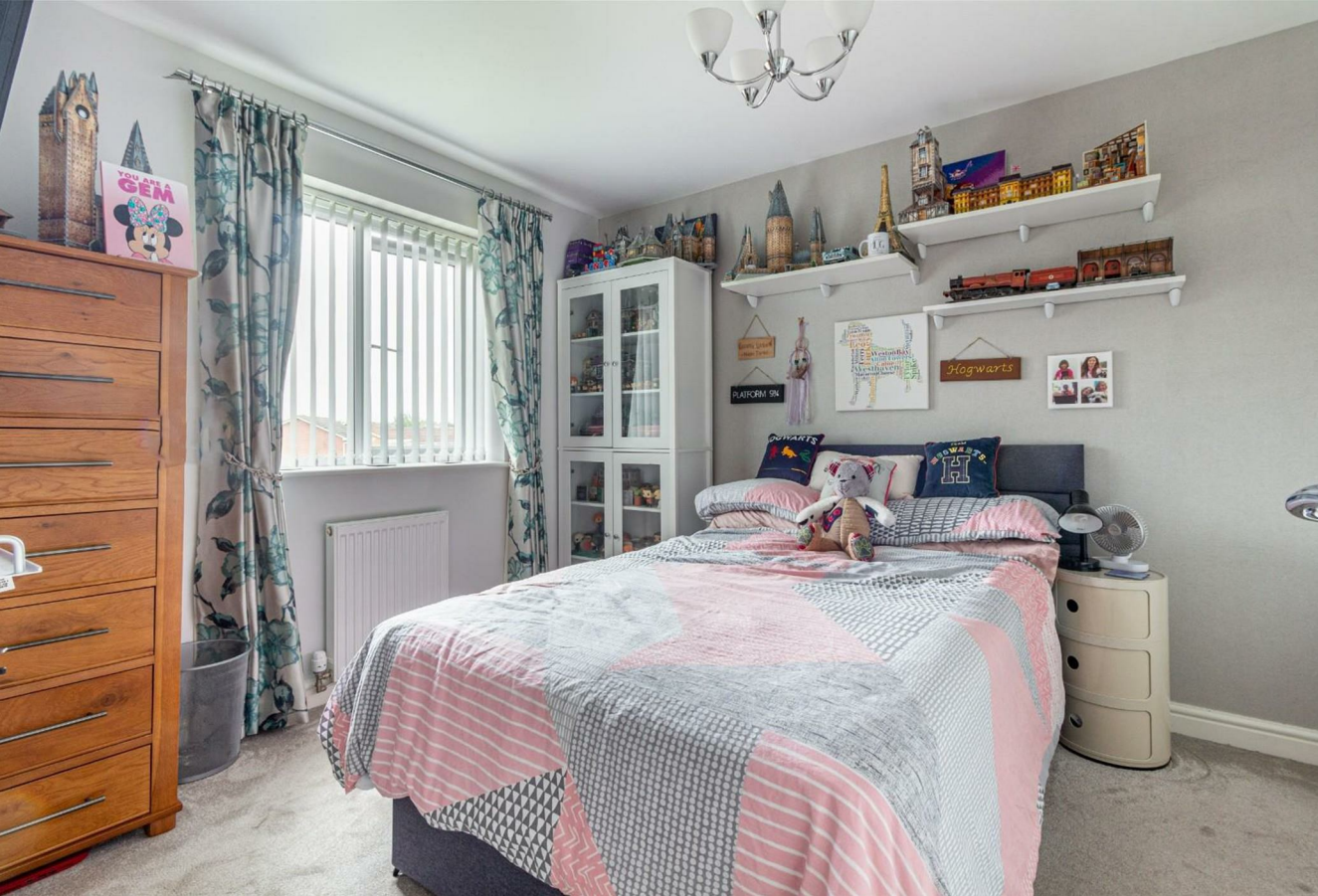
Bedroom Four Family Bathroom